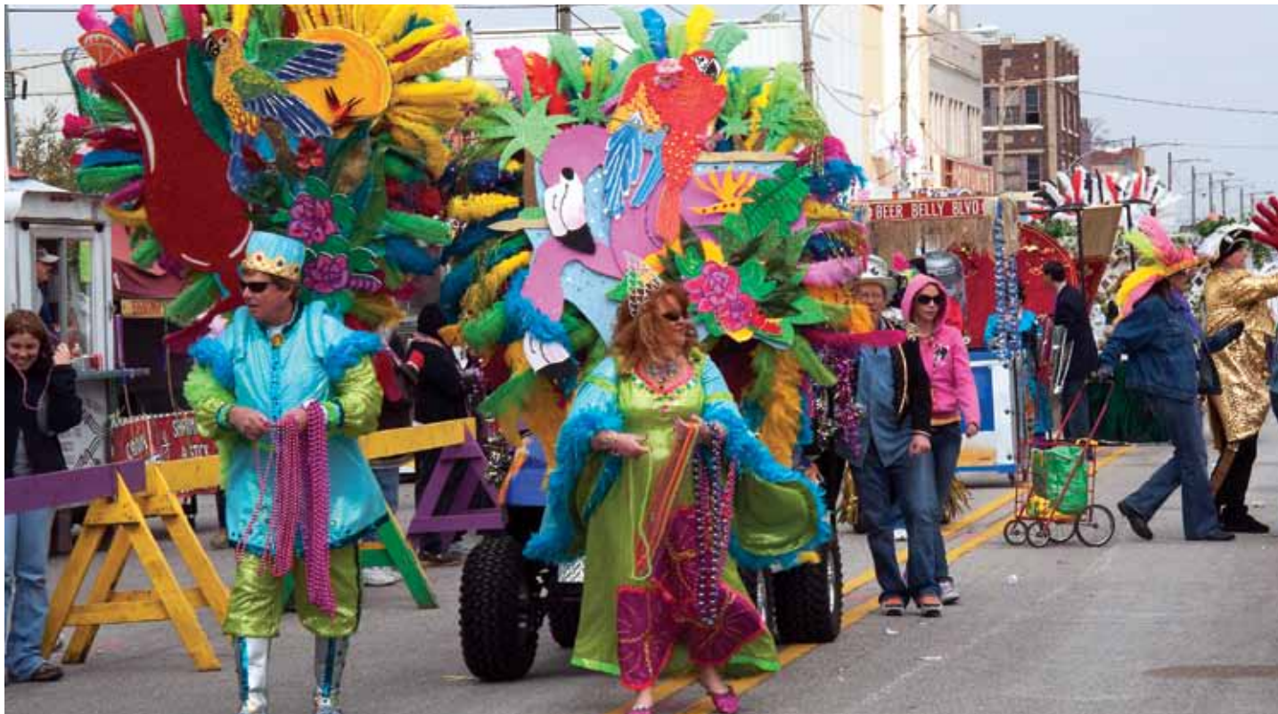
Mardi Gras in Port Arthur