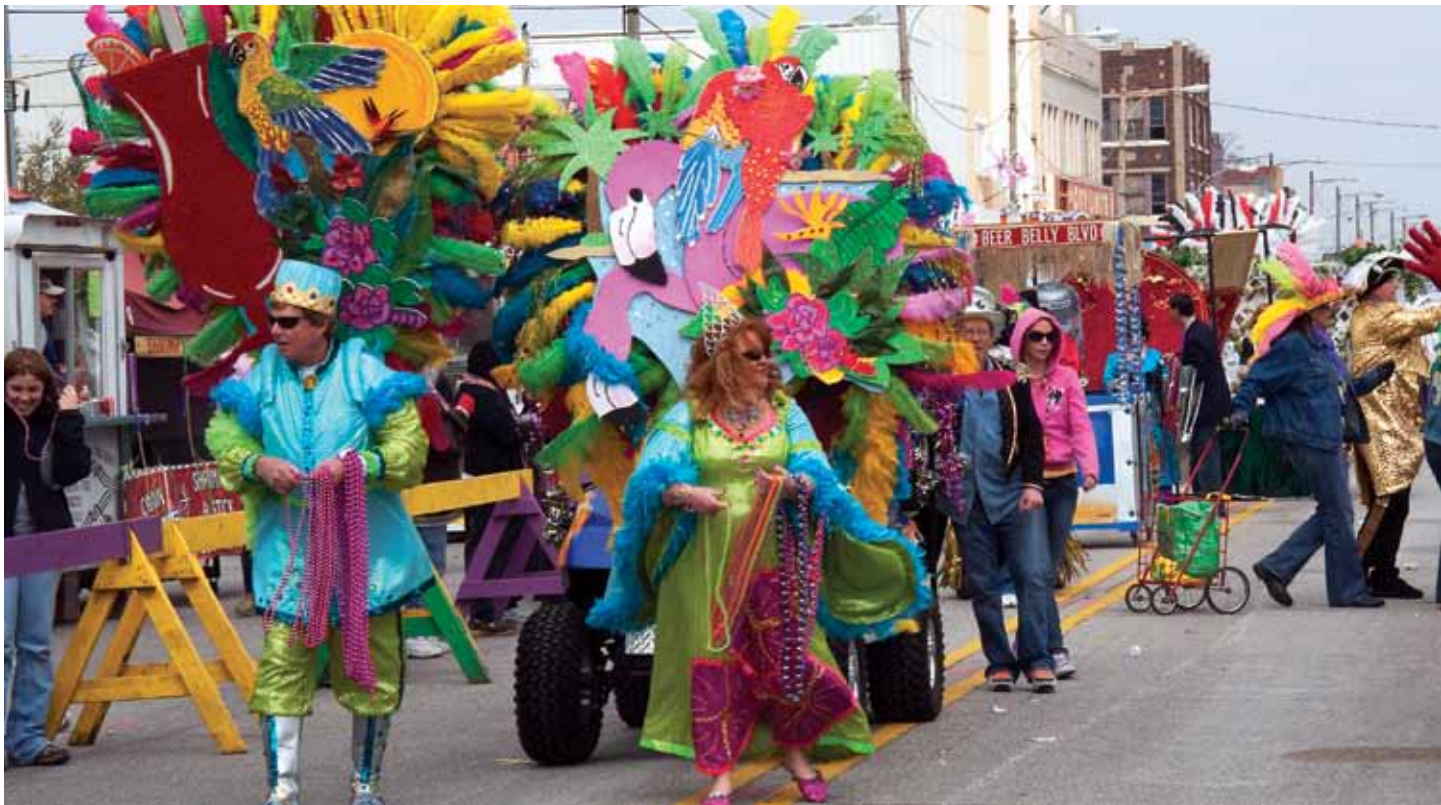
Mardi Gras in Port Arthur