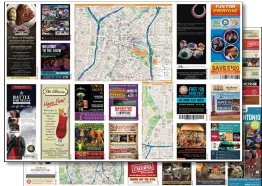
Full-Size Rack Maps

Where® Maps offer the single best visual overview of the city. A must-have for visitors on the go and an essential resource for hotel concierges. Accurate, up-to-date and visually appealing, Where Maps provide the most direct, user-friendly route to the city's top sights, shops, restaurants and entertainment shopping options.